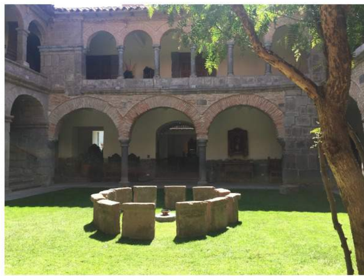
Inkaterra La Cascona