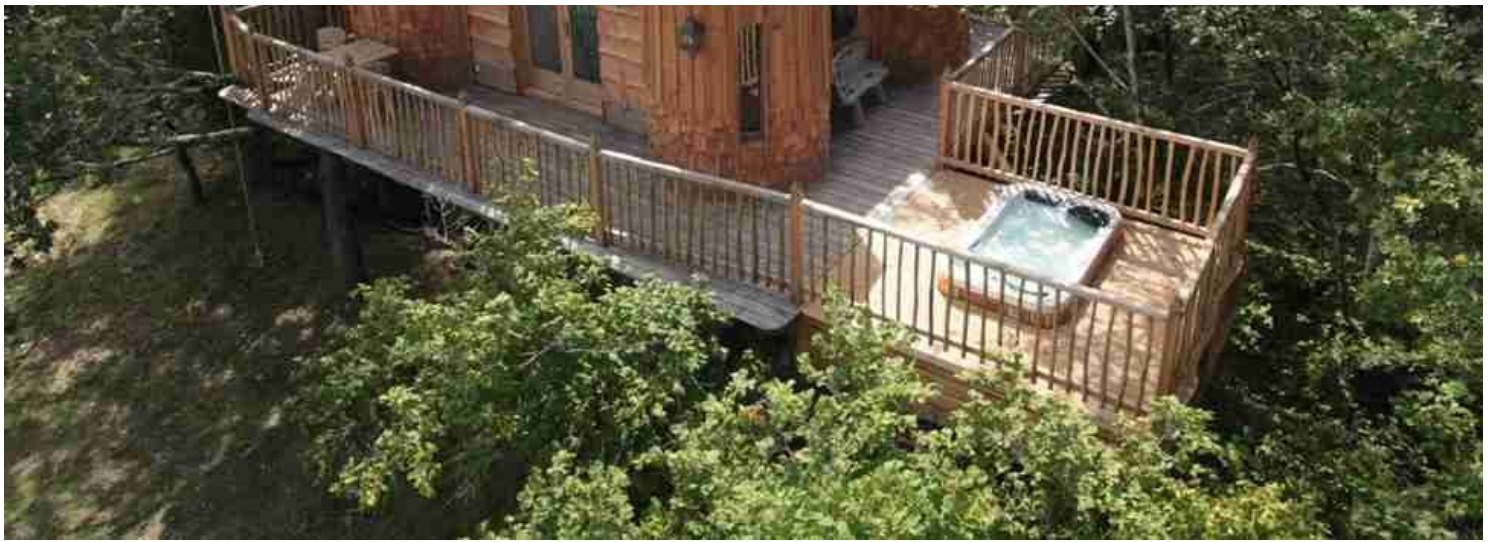
CHÂTEAUX DANS LES ARBRES | CHÂTEAUX DANS LES ARBRES IN THE DORDOGNE