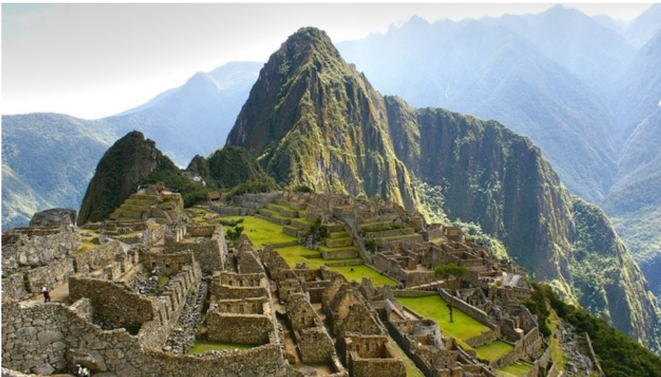
PHOTO: Peru's perennially popular Machu Picchu ruins.

Peru's Machu Picchu is an iconic tourist attraction that draws visitors from around the world, but officials have instituted a new set of rules that will hopefully conserve the historical site for years to come.