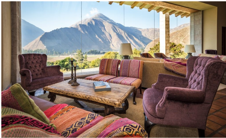
Inkaterra Hacienda Urubamba is a contemporary hacienda-style hotel in the Sacred Valley of the Incas, in-between Cusco and Machu Picchu

As we become increasingly aware of the long-term effects we have on our planet, in particular when it comes to travel, so do our millennials. Our tech-savvy generation are continuing to broaden their understanding of the planet's needs and are making eco-conscious decisions in terms of their living arrangements, their choice of and also their travel plans.