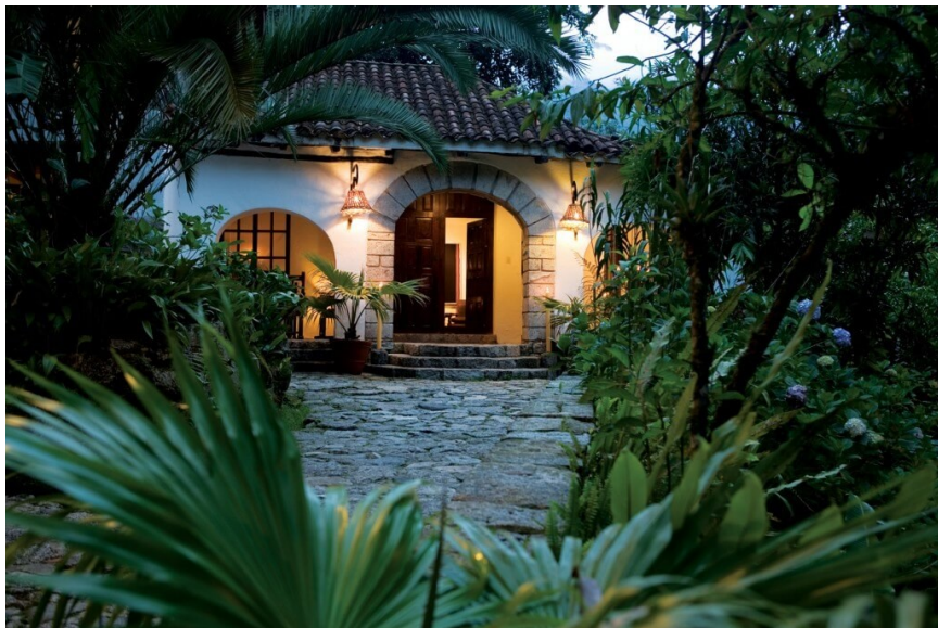
Inkaterra Machu Picchu Pueblo Hotel is an intimate Andean village with terraced hills, waterfalls, stone pathways and 83 whitewashed casitas tucked away in the cloud forest

As we become increasingly aware of the long-term effects we have on our planet, in particular when it comes to travel, so do our millennials. Our tech-savvy generation are continuing to broaden their understanding of the planet's needs and are making eco-conscious decisions in terms of their living arrangements, their choice of and also their travel plans.