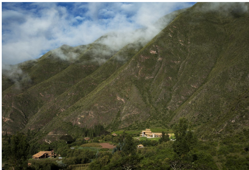
Inkaterra Hacienda Urubamba is a contemporary hacienda-style hotel in the Sacred Valley of the Incas, in-between Cusco and Machu Picchu

6 8% of global travellers were likely to choose an accommodation if they knew it was eco-friendly...And among those who didn't plan on a stay in a sustainable accommodation, 39% said it was because they didn't know sustainable accommodations exist - Booking.com survey on Sustainable Travel