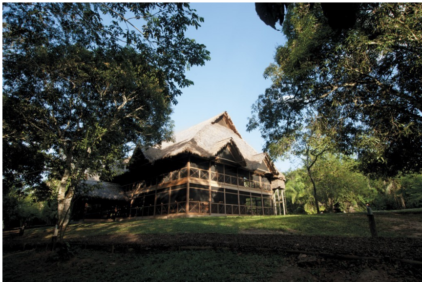
Inkaterra Hacienda Concepción , located between the Tambopata National Reserve and the shores of the Madre de Dios River

As proud pioneers of sustainable hospitality in Peru, we here at Inkaterra welcome millennial travellers and this increased awareness with open arms. Eco-tourism is emerging as the way forward in travel, and we are honoured to be one of the front-runners in this shift.