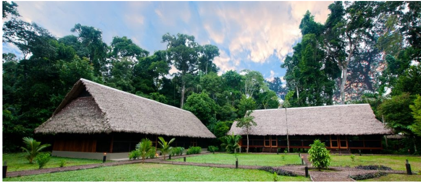
Inkaterra Guides Field Station, based near the Tambopata National Reserve welcomes visitors who are keen to explore the rainforest, and actively participate in various exciting conservation projects.

Our sustainability policy is at the heart of our ethos and is entirely integrated into the Inkaterra experience. For the past four decades we have worked towards creating a positive impact on our ecosystems, with sustainable use of biodiversity, and the utmost respect towards social, cultural and environmental values. We find it encouraging to see that the next generation is paving the way to further establish this global trend.