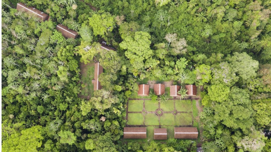
Inkaterra Guides Field Station, based near the Tambopata National Reserve

authentic experiences and the sense of adventure. For many, it's all about experiencing a new culture, learning about its history and "living like a local".