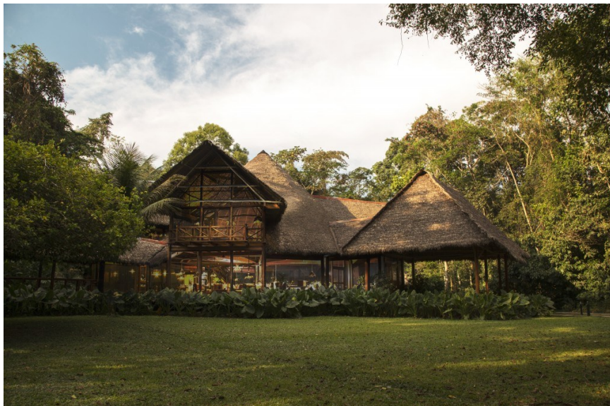
Inkaterra Reserva Amazonica , an eco-luxury lodge in front of Madre de Dios River