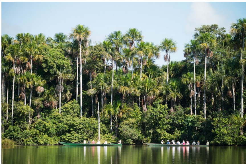
Inkaterra Hacienda Concepción , located between the Tambopata National Reserve and the shores of the Madre de Dios River

The aspiration to showcase eco-friendly credentials on social media is an important factor in increasing awareness of eco-tourism, with millennials not only looking to post pictures of their holiday but also to showcase to their following that their vacation is eco-friendly. These leaders of the technology age are increasingly attracted by