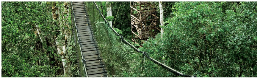
Inkaterra Reserva Amazonica is a realm of discovery, with trekking trails and a canopy walkway, leading through the heart of the vast rainforest

As proud pioneers of sustainable hospitality in Peru, we here at Inkaterra welcome millennial travellers and this increased awareness with open arms. Eco-tourism is emerging as the way forward in travel, and we are honoured to be one of the front-runners in this shift.