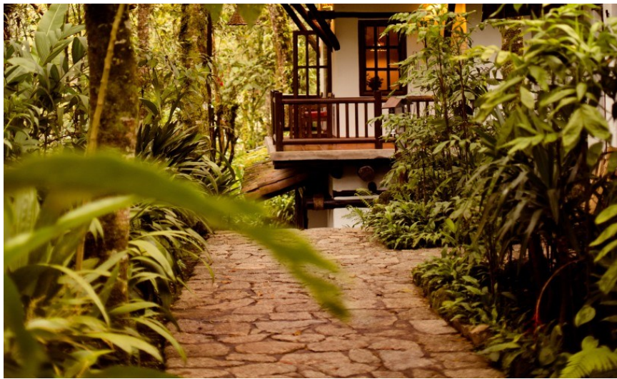
Inkaterra Machu Picchu Pueblo Hotel is an intimate Andean village with terraced hills, waterfalls, stone pathways and 83 whitewashed casitas tucked away in the cloud forest

Sustainable eco-friendly hotels have become the younger generation's new best friends, as eco-conscious travellers, with disposable incomes, lead the way towards this growing trend.