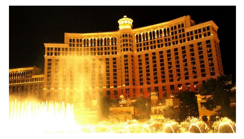
PHOTO: Awards will be handed out at the Bellagio in August.

TRAVEL AGENT | VIRTUOSO | JANEEN CHRISTOFF | JUNE 13, 2017