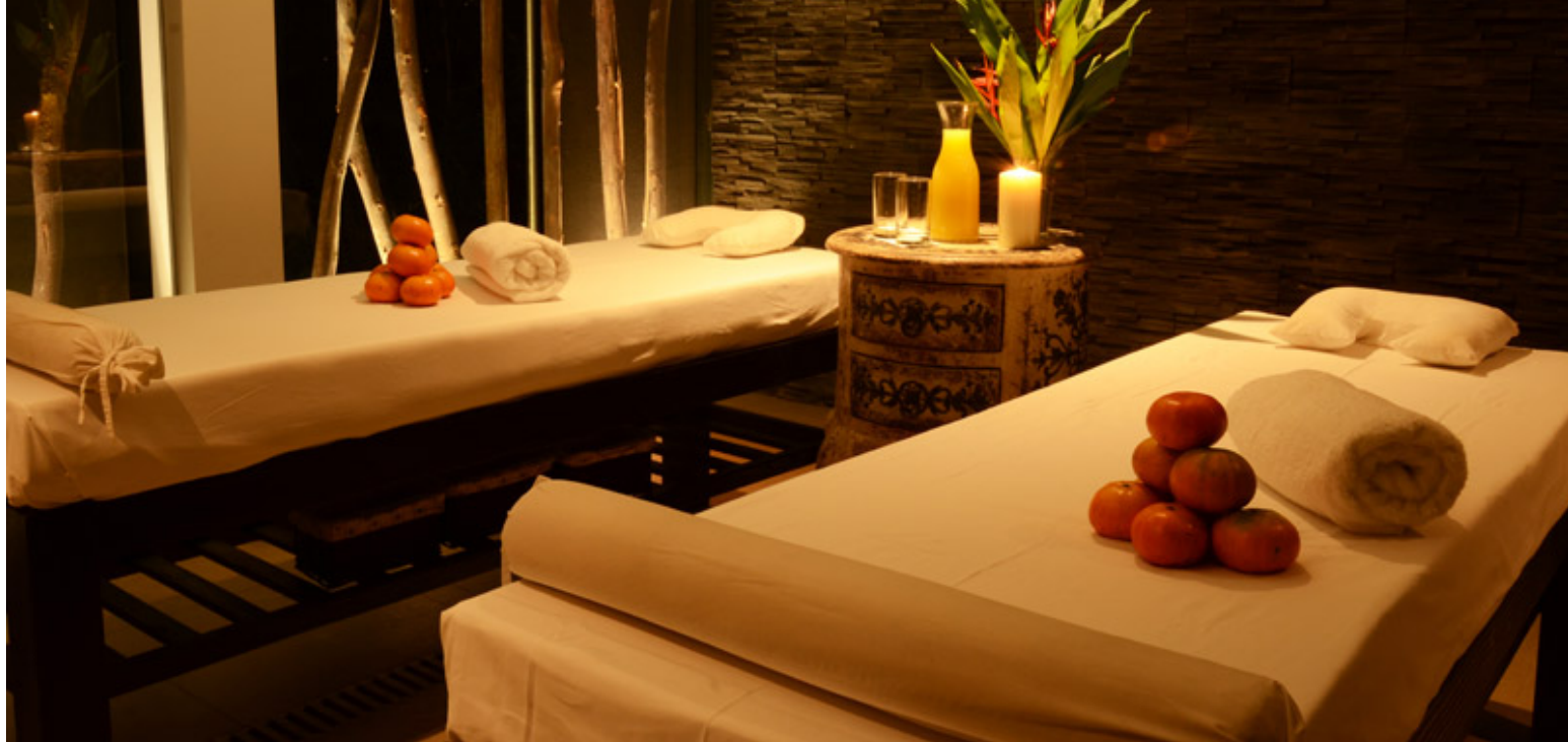
A treatment room at El MaPi's new organic spa.