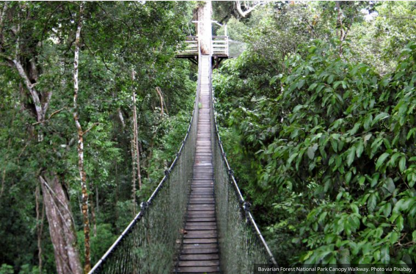
Bavarian Forest National Park Canopy Walkway.