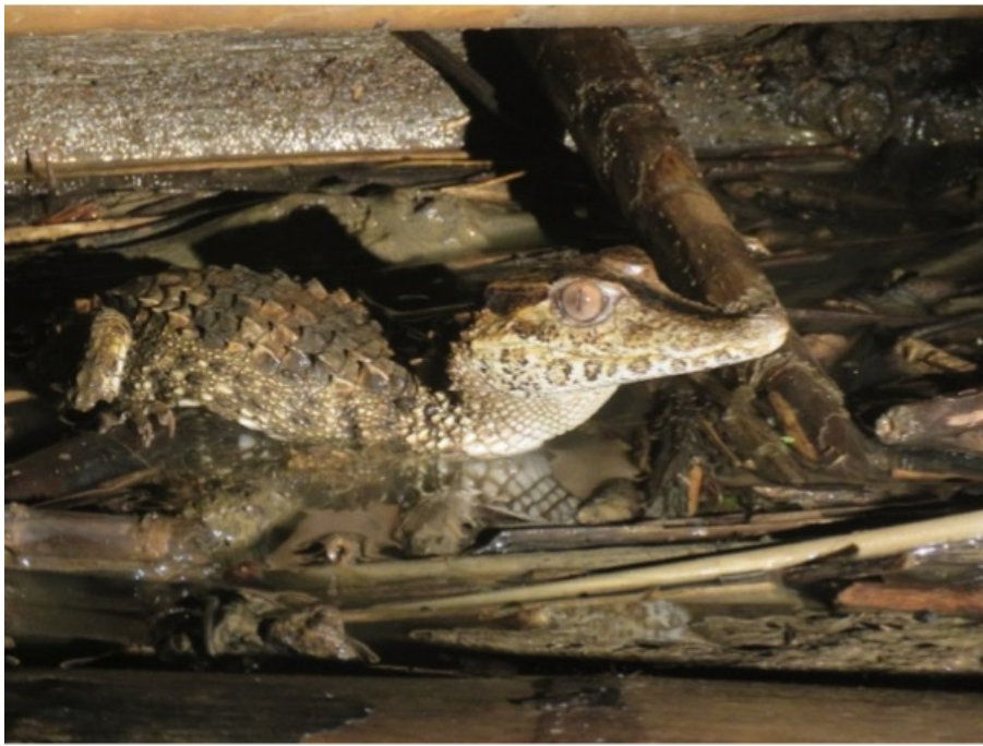
EXPLORER-GUIDE: PLINIO ARAPA

On the same day, we were thrilled to set our eyes upon yet another discovery. As part of our night river excursion, we caught a rare glimpse of this beautiful dwarf caiman ( Paleosuchus palpebrosus ) resting along the Madre de Dios river bank. This species of caiman is not observed very frequently, so we were delighted to be greeted with such a treat!