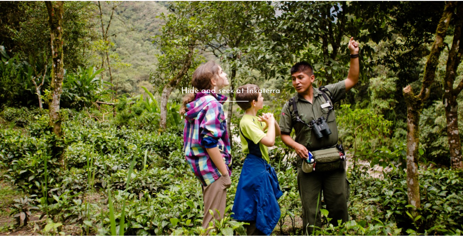
Hide and seek at Inkaterra

What makes an Inka-redible guest experience, you ask? Immaculate accommodation, impeccable service or delicious food perhaps? At Inkaterra we offer much more. An enchanting aspect of the Inkaterra experience is the opportunity for guests to be fully integrated into the natural habitat that surrounds our properties, catching a glimpse of our fauna friends in their natural environment. Inviting guests to join our conservation journey is one of the many reasons why four of our hotels have joined National Geographic Unique Lodges of the World .