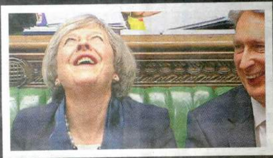
'Guffawing': Mrs May and Mr Hammond on Budget day

PHILIP HAMMOND was forced into a U-turn over his 'white van man tax' yesterday, just a week after announcing it in the Budget. The chancellor conceded the rise in National Insurance contributions for self-employed workers went against a Tory manifesto pledge. And he told the Commons he only realised he had broken the promise when the BBC reported it. Labour's John McDonnell, the shadow chancellor, seized on the