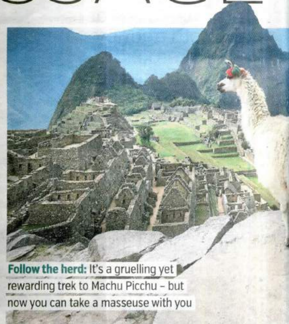
Follow the herd: It's a gruelling yet rewarding trek to Machu Picchu - but now you can take a masseuse with you

T HE cloud forest-covered Inca Trail of Peru is a spirit-raising trek of mountain and barren tundra filled with Instagrammable vistas of lagoons and rivers. It leads to Machu Picchu, perhaps the most gobsmacking world wonder of them all. But it's also tough.