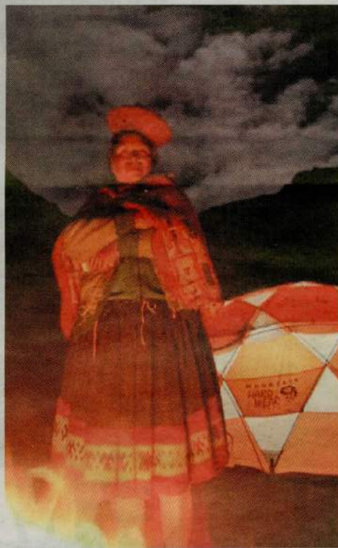
Wrap up: You'll camp for three nights en route