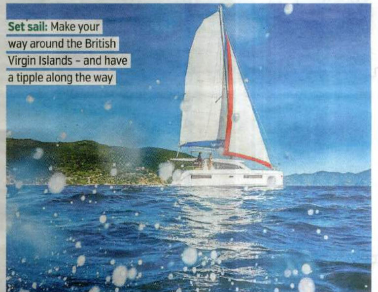
Set sail: Make your way around the British Virgin Islands - and have a tippie along the way