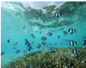
Hotspots for sustainable diving