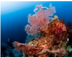
Sustainability in diving