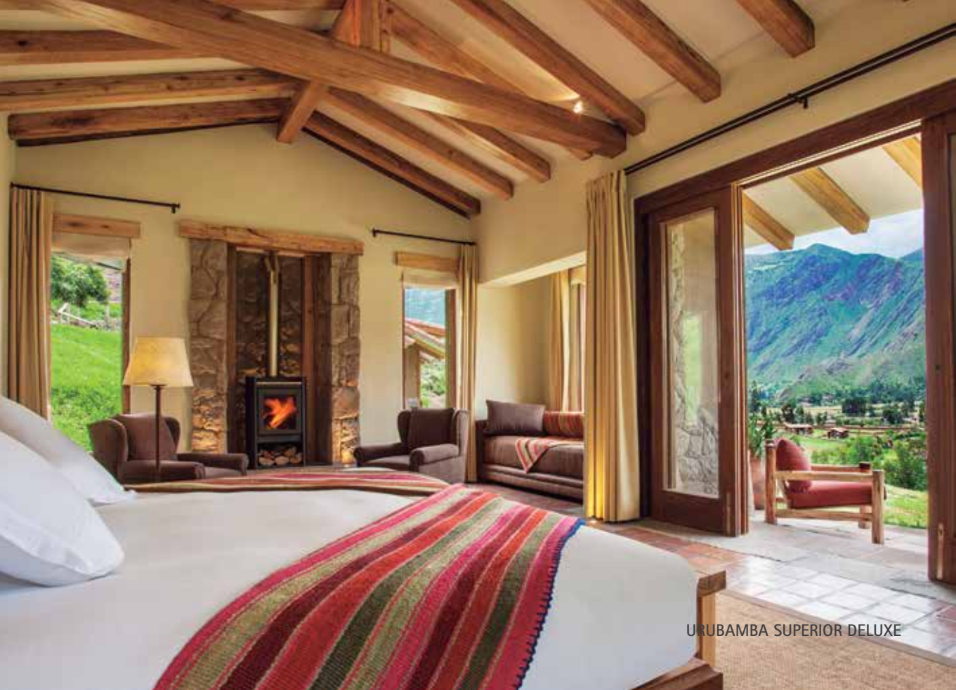
URUBAMBA SUPERIOR DELUXE

“EXPERIENCIAS ECOLÓGICAS QUE SE VEN RECOMPENSADAS AL RETORNO DEL RECINTO DONDE NOS ESPERAN SERVICIOS DE SPA DE TODA INDOLE, ESPACIOSAS Y SILENCIOSAS HABITACIONES AL CALOR DE LA CHIMINEA CON HIPNÓTICAS VISTAS PANORAMICAS; Y, PARA REPONERSE, UN EXTENSOR MENU SALUDABLE DE COMIDA PERUANA E INTERNACIONAL PREPARADO CON INGREDIENTES ORGÁNICOS OBTENIDOS EN LA GRANJA.”