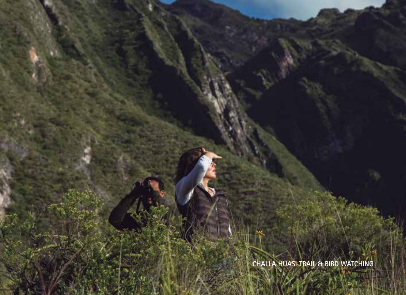
CHALLA HUASI TRAIL & BIRD WATCHING