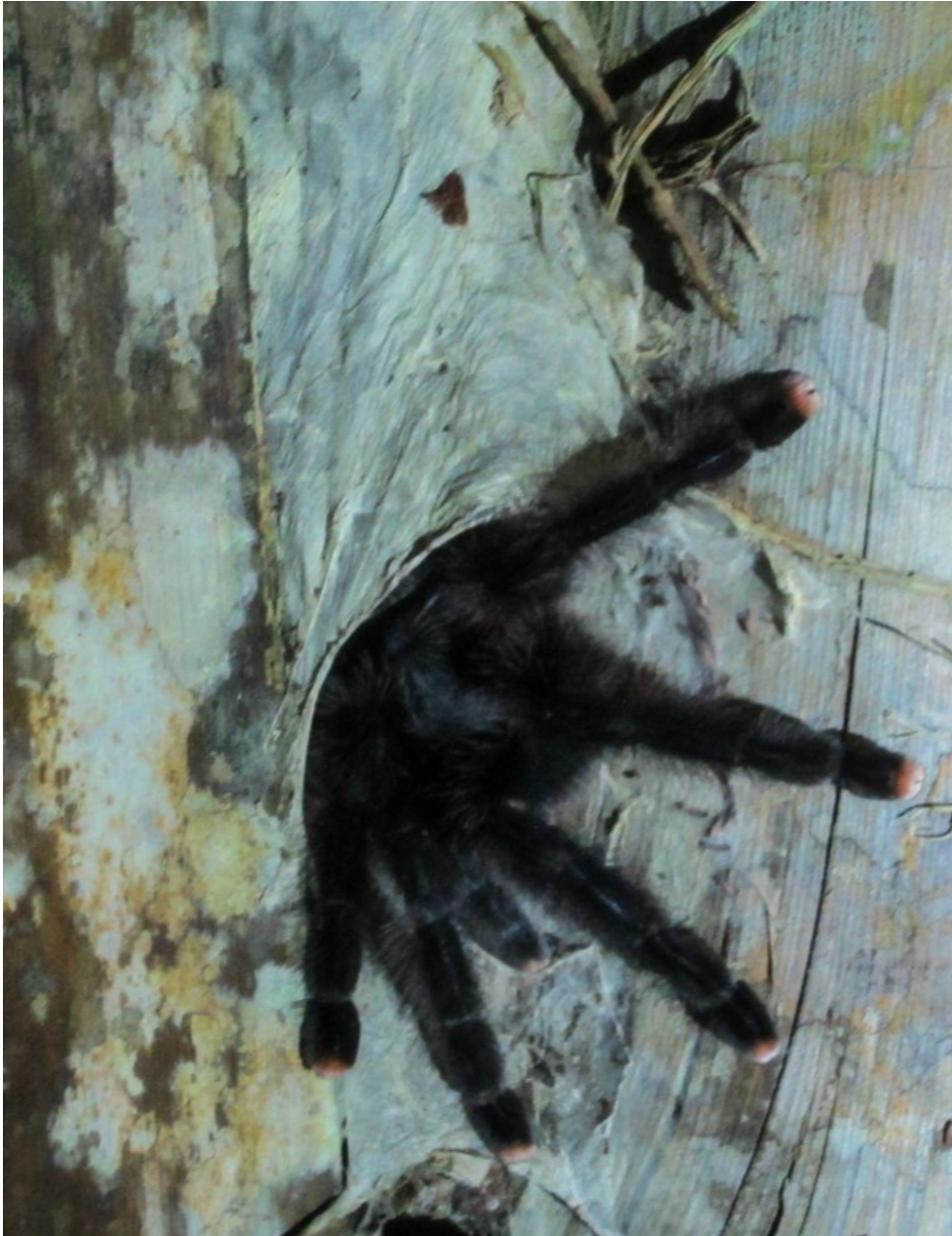
Hunting for nocturnal beings like giant tarantulas by flashlight

Trek through the rainforest trails as daylight ebbs, with only the beam of your flashlight, on the lookout for nocturnal wildlife – spiders, tarantulas, scorpions.