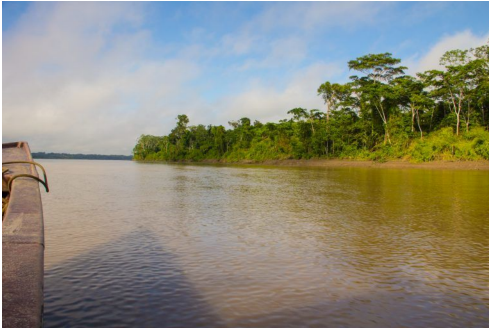
Making Our Way Down the Madre de Dios River by Boat

As we skim along the waterway we are greeted by our first glimpses of wildlife, cayman sunning themselves on the shore, colorful macaws flitting amongst the treetops. Our hosts regale us with stories of their adventures and we are eager to experience all of it.