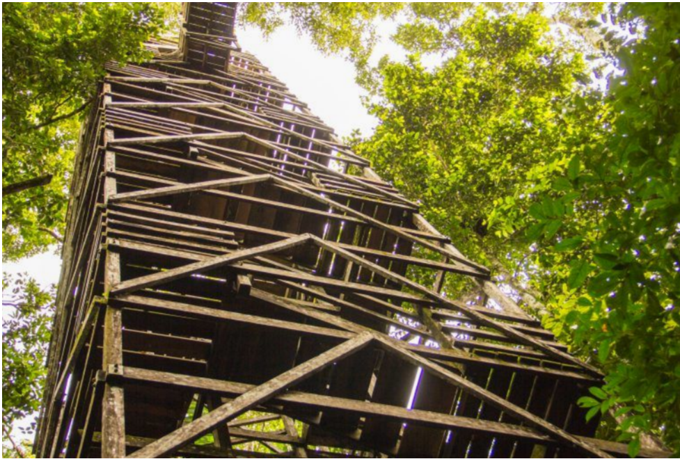
Climb to the top of the 100 ft tower to enter the Tree-top walk