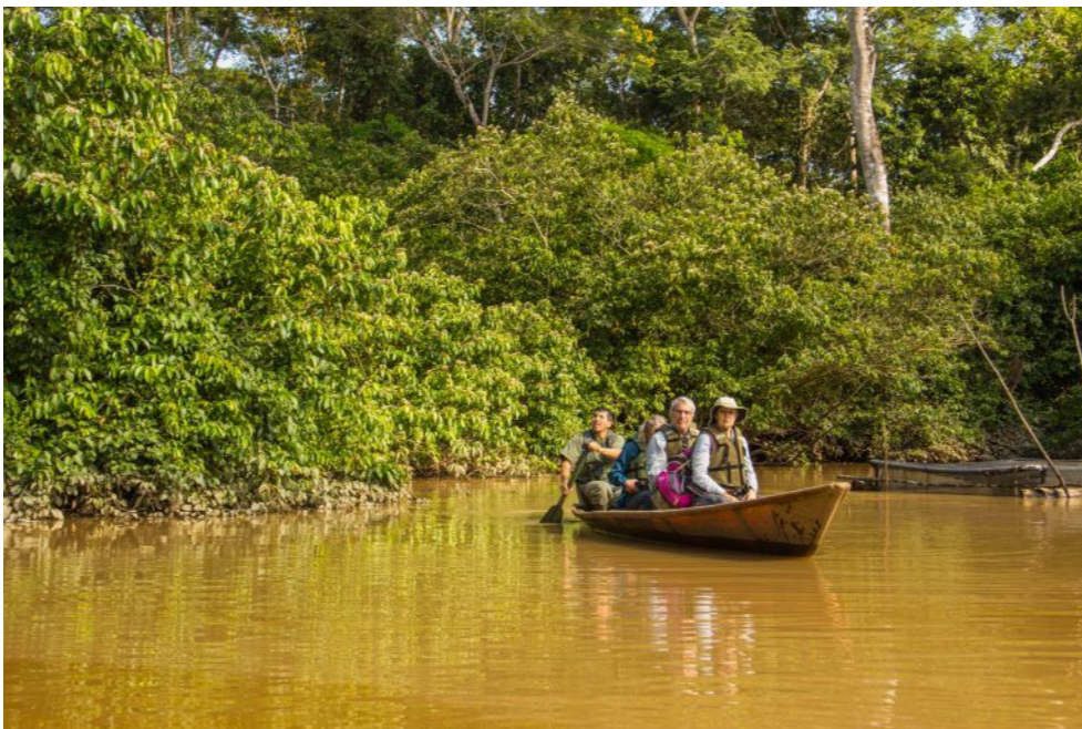
Alert for wildlife as we slowly canoe around the jungle lake

Take a canoe ride on a still jungle lake, the only sounds being the dipping of the paddle, the buzzing of the insects and the calling of the birds in the treetops. Scan the treetops for monkeys and sloths, alert for turtles, sun grebes, nightjars and herons along the watery shore. Explore the botanical gardens as a guide shares the natural and traditional medicinal properties still used today in rural Peru.