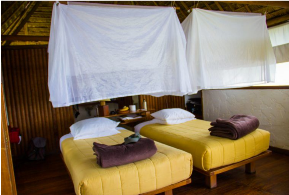
The netting pulls down around the comfortable beds to keep out any insects for a good night's sleep in the cabana.

We are equipped with a pair of sturdy rubber boots, a flashlight and a lantern. You see, we are in the jungle, off the grid. Generators supply electricity for a few hours each day when it is needed to run the complex. The rest of the time visitors rely on candles, flashlights and lanterns. There is no TV or internet, no cellphone reception. Here you relax, unwind, tune out the stress of everyday life and tune in with nature.