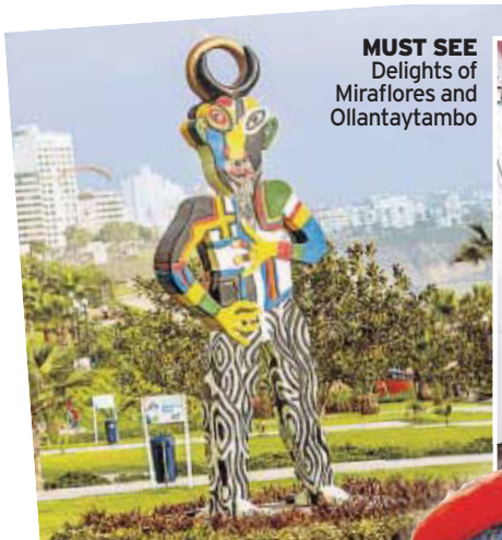
MUST SEE Delights of Miraflores and Ollantaytambo