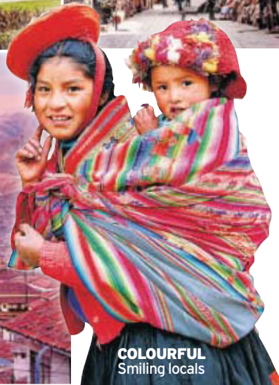
COLOURFUL Smiling locals