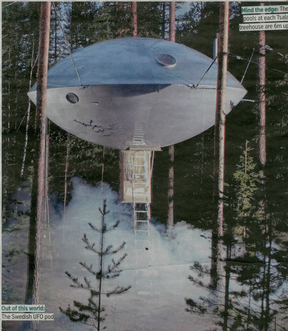
Out of this world: The Swedish UFO pod

PLUMLY positioned in front of France's highest peak, this new luxury cabin has its own sauna and hot tub. More cosiness awaits inside, too, with a wood-burning stove and the double bed set into a lamp-lit, curtain-covered corner – a nook for nookie. Chocolates, champagnes and candlelit dinners can be