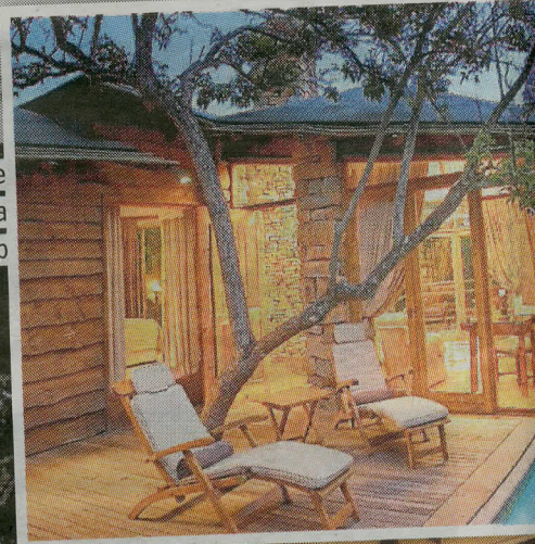
Mind the edge: The pools at each Tsala treehouse are 6m up