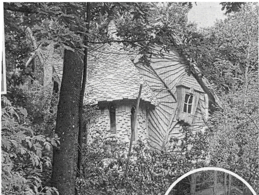
Enchanted: The fairy-tale treehouse in Blackberry Wood