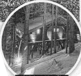
Peak: Cabane Mont Blanc