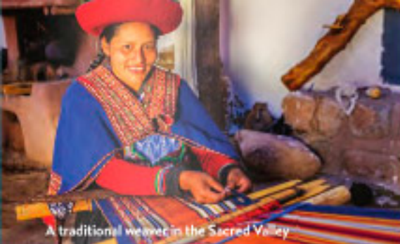
A traditional weaver in the Sacred Valley