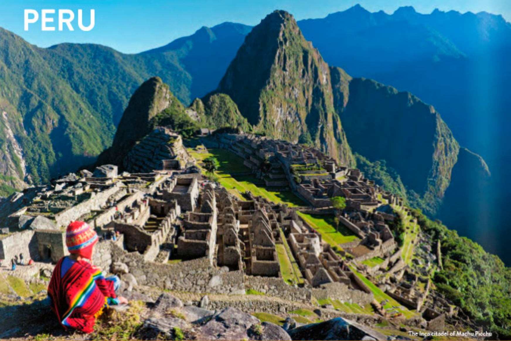
The Inca citadel of Machu Picchu

Still shrouded in the mysteries of Inca civilization, Peru's Sacred Valley is a treasure trove of ancient ruins, dramatic landscapes, and Andean villages that still cling to age-old traditions. Starting in magical Cusco, trace the legacy of the Inca all the way to their crowning achievement: the citadel of Machu Picchu. Immerse yourself in this enchanting land, meeting artisans and farmers and getting acquainted with daily life in the Andes. Stay in a historic manor house, go stargazing high in the mountains, and enjoy two full days to explore Machu Picchu and its environs.