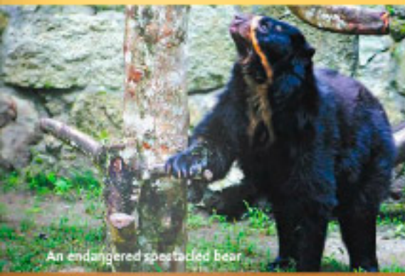
An endangered spectacled bear