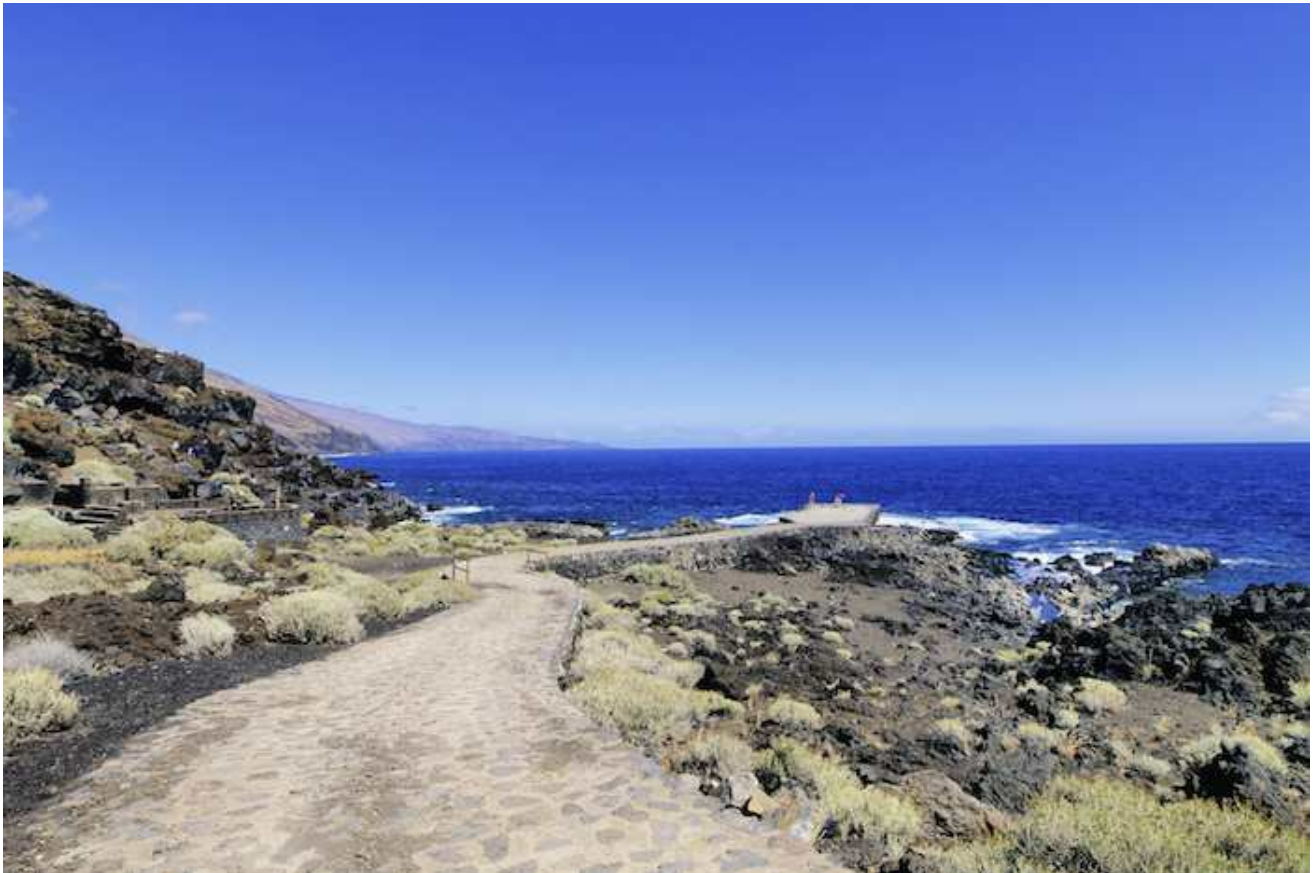
Unusual Sun Seeking Destinations For The End Of Winter | El Hierro

Departing 8 th March 2016, 7 days from £5,440 per person excluding flights. For more information please visit www.steppestravel.com / 0843 778 9926