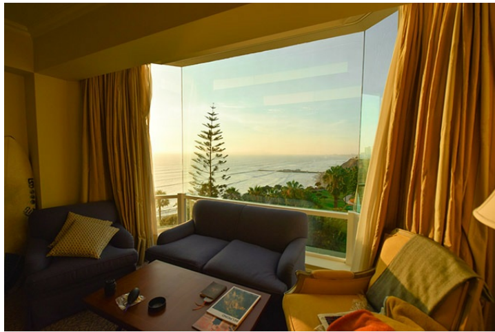
Views don't get much better than that.

The Belmond Miraflores Park hotel offers luxurious accommodations featuring a private sauna in your suite's bathroom, a rooftop pool, and sweeping views of the coast.