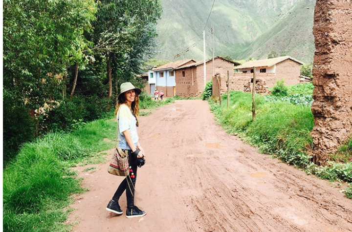
Trekking near Cusco.

No visit to Peru is complete without a journey into the Andean heart of Cusco, The Sacred Valley, and Machu Picchu. Fly into Cusco from Lima (one hour) and spend a couple days acclimatising and exploring this fascinatingly vibrant city that was capital of the Inca Empire.