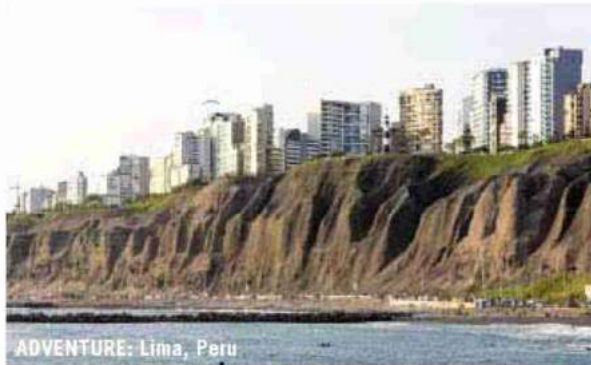
ADVENTURE: Lima, Peru