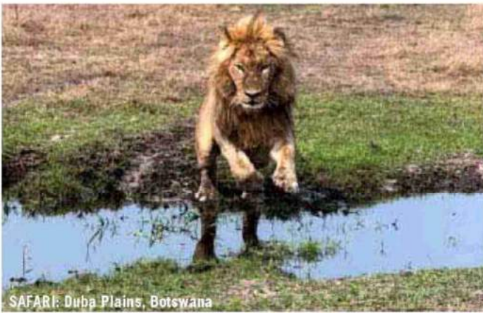
SAFARI: Duba Plains, Botswana