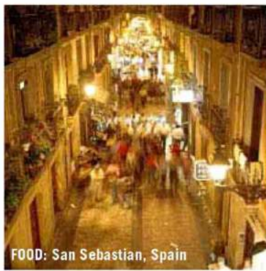
FOOD: San Sebastian, Spain