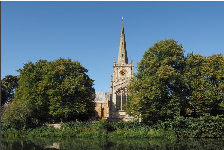
Holy Trinity church in Stratford upon Avon (51872926)