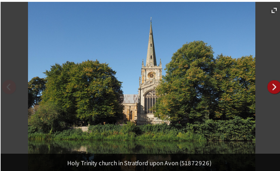
Holy Trinity church in Stratford upon Avon (51872926)