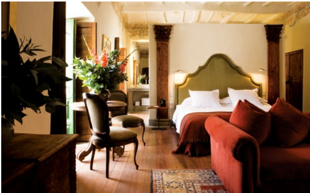
Inkaterra La Casona Boutique Hotel in Cusco.