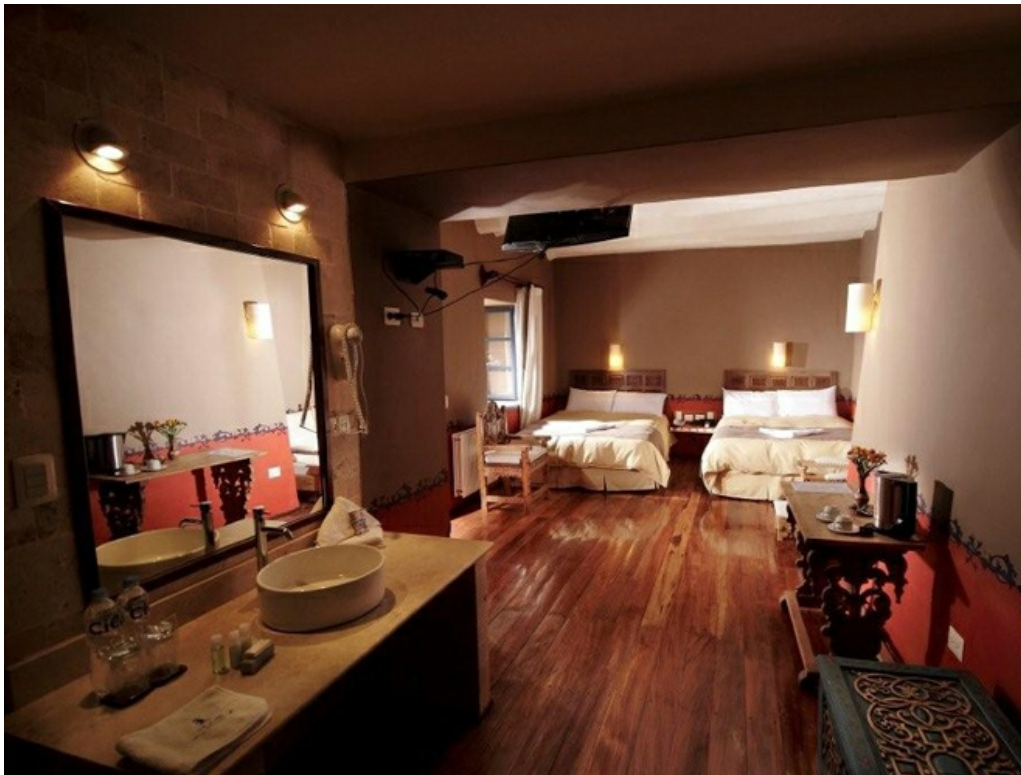
Tambo del Arriero Boutique Hotel in Cusco.