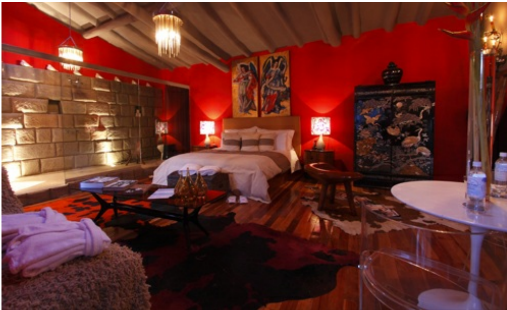
The Fallen Angel Boutique Guesthouse in Cusco.