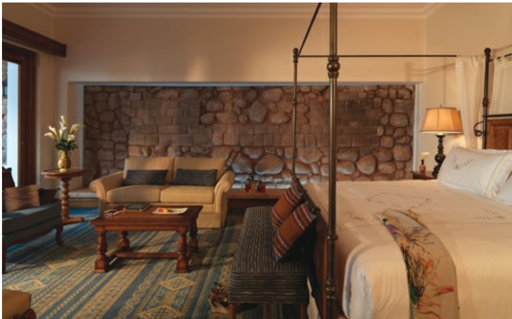
The Belmont Palacio Nazarenas Hotel in Cusco.