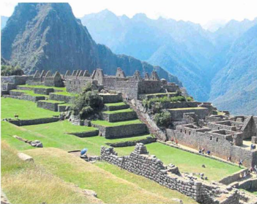
ICONIC: Machu Picchu, Peru