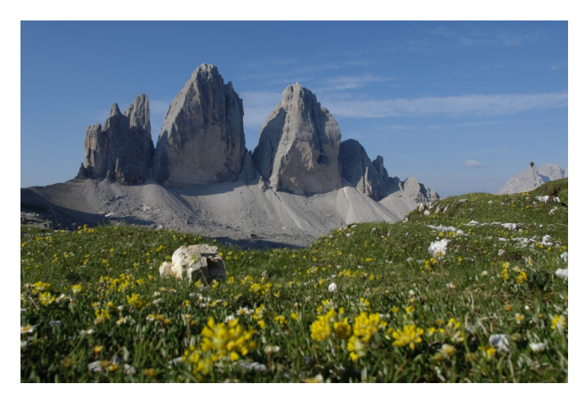
At Leitlhof in Italy, a true fairytale wedding location is waiting for you.

You have to see it to believe it; this place is truly magical. Deeply rooted in the traditions and philosophies of Thailand, the Keemala is authentic and takes care of its natural resources as well as its committed staff who will arrange your wedding down to the finest detail, whether you travel with a wedding party or just with your fiancée.