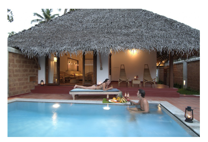
At CGH Earth Marari Beach, you and your partner can concentrate on the most important thing: love.

This is the perfect place for a winter wonderland wedding, or a romantic summer wedding outdoors.