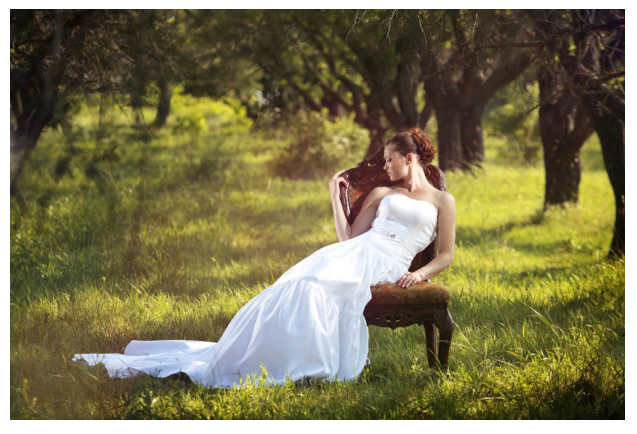
At Keemala, your fairytale wedding will come true.

The Inkaterra Machu Picchu Pueblo Hotel offers guided nature tours (for any level) and they will make your honeymoon extra special. Inkaterra is committed to conserving the environment and running their hotels sustainably, so your newlywed conscience can be clear.