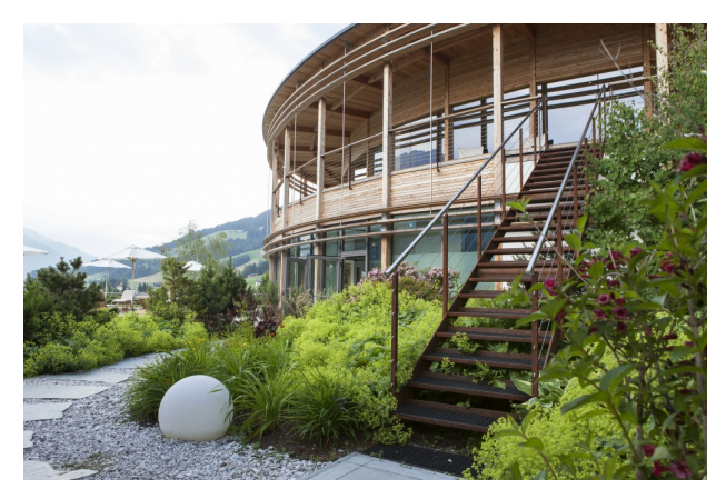
At the Leitlhof spa, newlyweds will get anything they are looking for.

The Sextner Dolomites as an impressive backdrop, and a hotel that will tick every box on your sustainable wedding checklist: this hotel is energy self-sufficient through the use of its own wood pellet fuelled power station. Ingredients used in the restaurant are locally sourced and organic, such as the lamb and sheep's milk from the hotel owner's son's sheep farm nearby. The spa offers relaxing treatments, a panorama pool and an outdoor sauna.