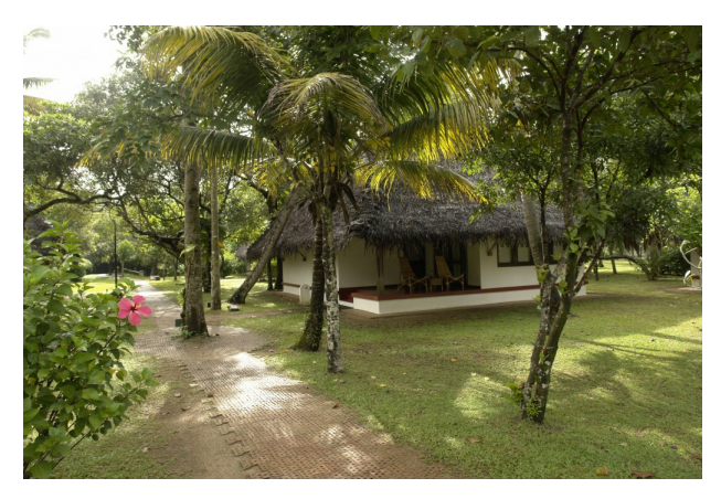
Marari Beach is the place for true romantics.

isn't one in your room (and let's face it, who needs TV on their honeymoon!).