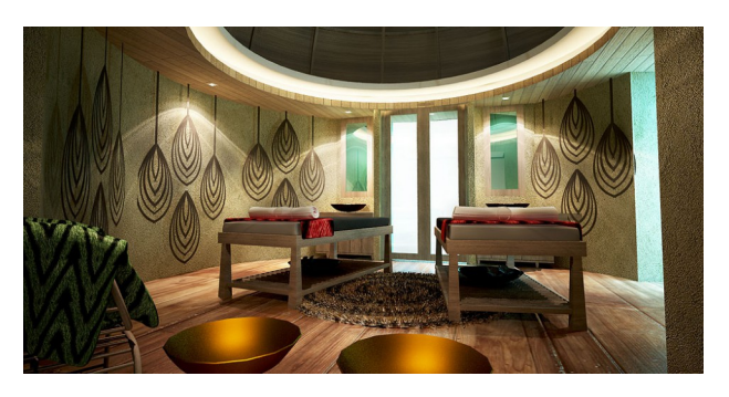
A special wedding package includes a relaxing couple massage at the spa.

You have to see it to believe it; this place is truly magical. Deeply rooted in the traditions and philosophies of Thailand, the Keemala is authentic and takes care of its natural resources as well as its committed staff who will arrange your wedding down to the finest detail, whether you travel with a wedding party or just with your fiancée.