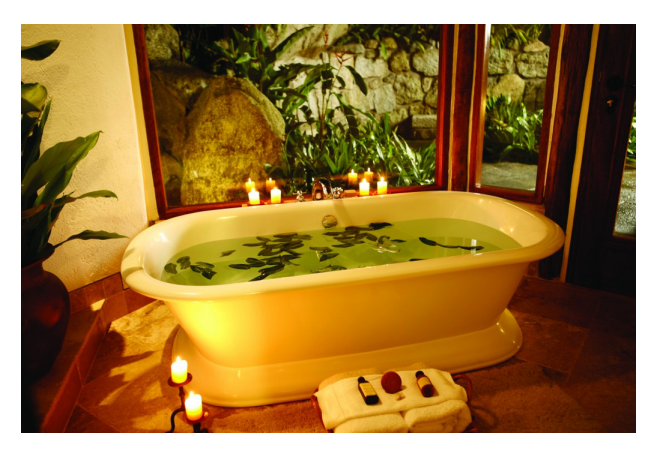
A relaxing Eucalyptus bath is just what newlyweds are looking for.

The Inkaterra Machu Picchu Pueblo Hotel offers guided nature tours (for any level) and they will make your honeymoon extra special. Inkaterra is committed to conserving the environment and running their hotels sustainably, so your newlywed conscience can be clear.