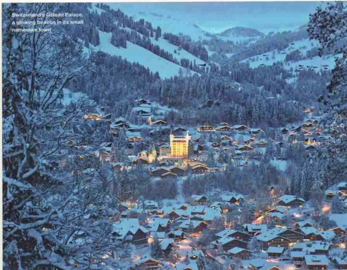
Switzerland's Gstaad Palace, a glowing beacon in its small namesake town

A Gilded Age hotel that lords over the tiny alpine village of Gstaad like a giant chess rook, this is Switzerland's definitive party palace, home to the infamous GreenGo Club, a swank disco with its own sprawling indoor pool. Oversize terraces abound.