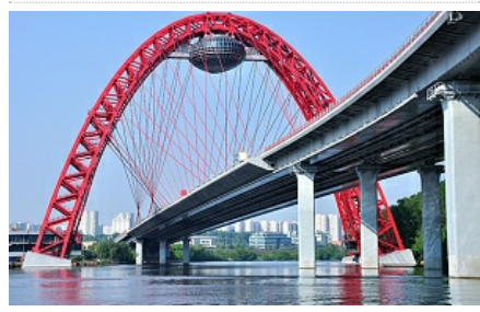
Six trips of a lifetime Be inspired by one of these inspirational once-in-alifetime journeys – and make your dreams a reality

Many tours also include meal provisions – you can opt for bed and breakfast accommodation or full board – ensuring you will not be hit with any hidden costs.