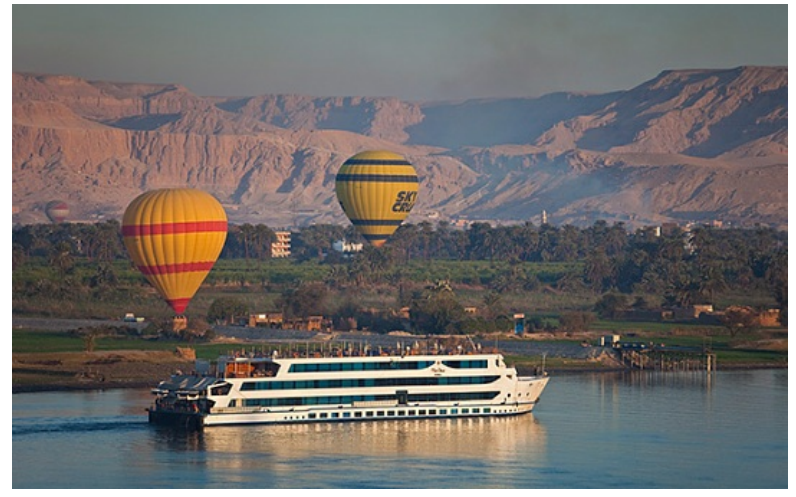
River cruising: a cruise along the Nile is an experience you'll never forget

At Luxor, board the luxurious Sanctuary Sun Boat and float away to the Ptolemaic Temple at Dendarah. Sail past the ancient temple at Esna en route to the Temple of Horus at Edfu, dedicated to the falcon-headed god.