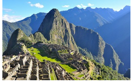
Classic journeys everyone should experience With a huge variety of destinations available, deciding where to go on holiday can be difficult, but here are five classic journeys not to be missed