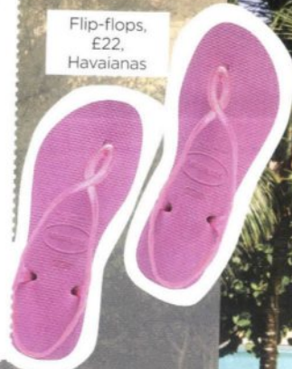
Flip-flops, £22, Havaianas