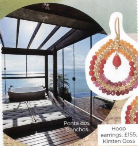
Ponta dos Ganchos

This is one of those hotels where even regular jet-setters squeal in delight as they enter their suite. And the cabanas with huge decks and pools are just the start of the wow-worthy offerings – there's a private island for romantic dinner and a tranquil spa in the pretty gardens. Three nights in Iguazú, incl. breakfast and excursions and seven nights at Ponta dos Ganchos incl. breakfast, flights and transfers, from £3761pp, audleytravel.com