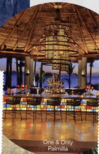
One & Only Palmilla

From £450 per night for two, incl. breakfast and complimentary mini-bar, hotelesencia.com