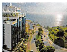
BELMOND MIRAFLORES PARK LIMA

Located in the city's historical center, JW Marriott El Convento Cusco was designed around a 16th-century colonial convent, which now houses 153 rooms (all with a built-in oxygen enriched system), restaurant, bar, spa, and archaeological exhibition spaces. ➔ jwmarriottcusco.com