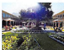
BELMOND HOTEL MONASTERIO CUSCO

Make the most of your journey to Peru by booking with these spectacular hotels, resorts, and river cruises.