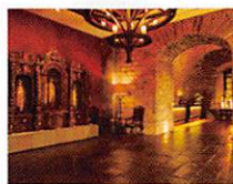
JW MARRIOTT EL CONVENTO CUSCO

Set behind Cusco's main square, this restored 17th-century palace is an irresistible mix of ancient and modern, with a fabulous spa, the city's first outdoor pool, and two cutting-edge restaurants. ➔ belmond.com