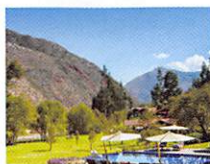
BELMOND HOTEL RIO SAGRADO SACRED VALLEY

Near Cusco's lively central square, this restored 16th-century monastery is a delightful retreat with exceptional architecture, a stunning central courtyard, and a gilded chapel hung with fine works of art. ➔ belmond.com