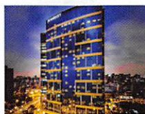
JW MARRIOTT LIMA

In the Sacred Valley of the Incas, Belmond Hotel Rio Sagrado lies among verdant fields and towering mountains on the banks of the Urubamba River. El Jardin restaurant offers an unforgettable natural culinary experience. ➔ belmond.com