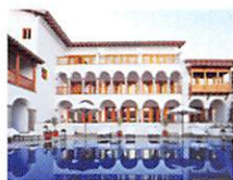
BELMOND PALACIO NAZARENAS CUSCO

With a stunning, central location in the Miraflores district, across from the Larcomar shopping center, the JW Marriott Lima offers sweeping views of the Pacific Ocean from its 300 rooms. Enjoy a Peruvian restaurant, sushi and ceviche lounge, and seasonal outdoor swimming pool. ➔ jwmarriottlima.com