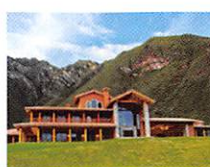
INKATERRA HACIENDA URUBAMBA VALLE SAGRADO - PERU

Just steps from the entrance to Machu Picchu, Belmond Sanctuary Lodge is the only hotel that neighbors the Inca citadel. This charming mountain retreat is the perfect place to relax. ➔ belmond.com