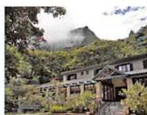
BELMOND SANCTUARY LODGE MACHU PICCHU

Aqua Expeditions is a leader in luxury small ship cruising on the world's greatest rivers, from Peru to Cambodia and Vietnam. Explore the Amazon on a one-of-a-kind journey aboard the Aqua Amazon or Aria Amazon. ➔ aquaexpeditions.com