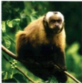
Left: Aqua Expeditions' Aria Amazon. Above: wildlife-watching with the crees foundation. Top: Manu Biosphere Reserve. Next page: paddle power; onboard the Aria Amazon