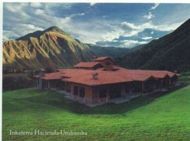
Inkaterra Hacienda Urubamba