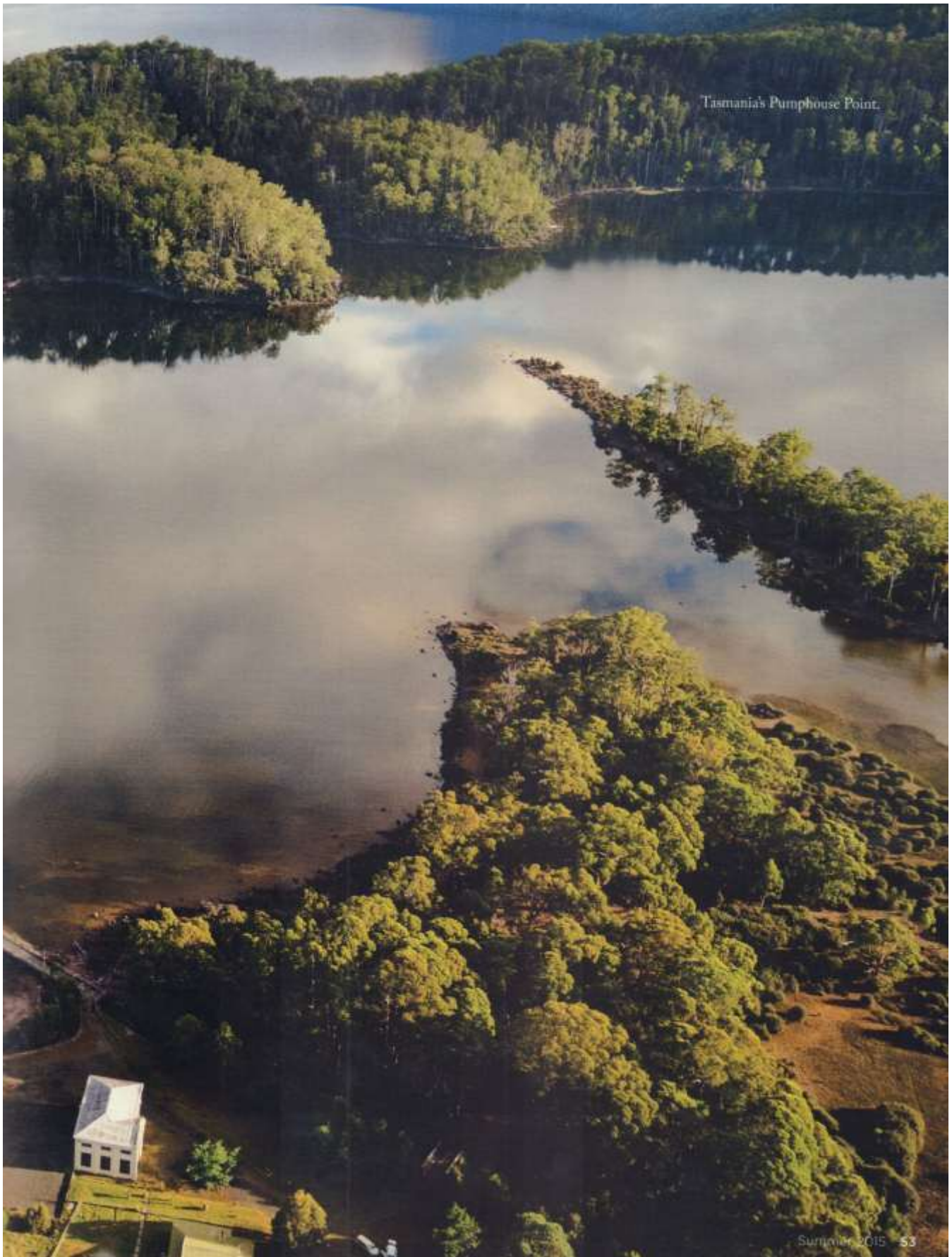
Tasmania's Pump House Point.