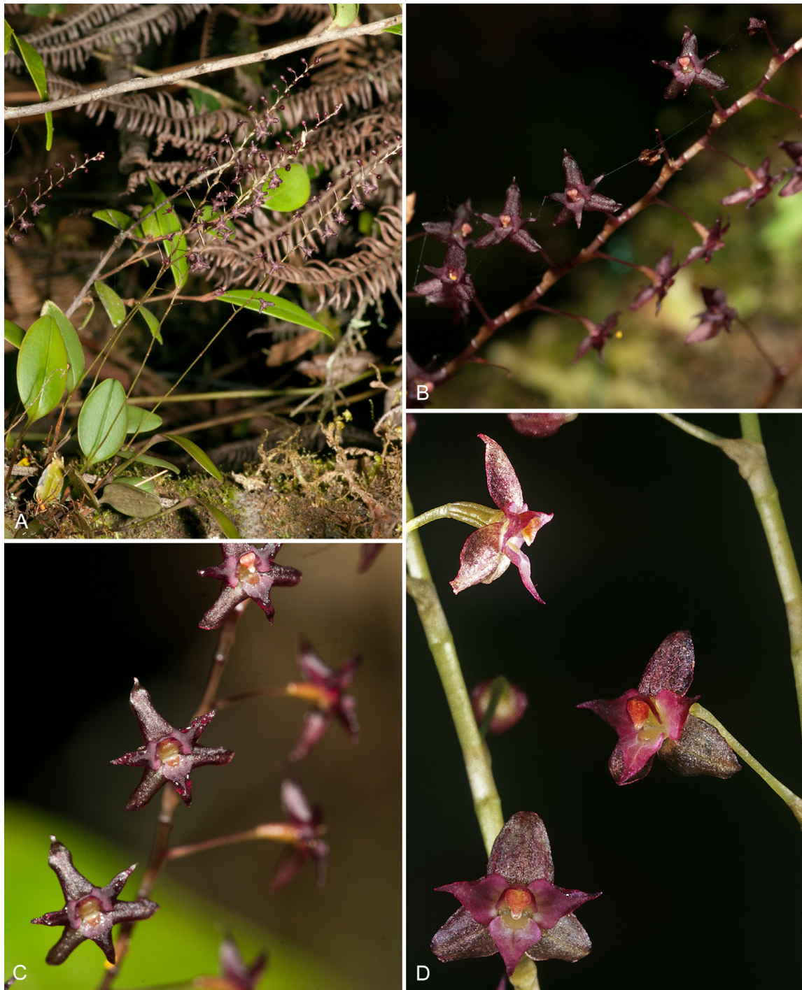
Fig. 2. Stelis machupicchuensis – A: habit of plant; B, C: segments of an inflorescence; D: flowers in close-up. – Photographs: A–C by J. Farfán based on Martel & Farfán 73 (USM!); D by B. Collantes based on the holotype.

2700 m, 20 Mar 2016, C. Martel & J. Farfán 73 (USM!) [Fig. 2A–C].