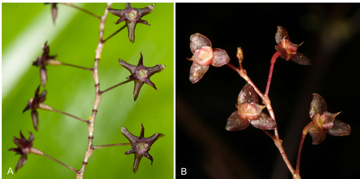
Fig. 4. Flowers of Stelis machupicchuensis (A) and Stelis antennata (B). Note the morphological differences of their lips. Both specimens from the same locality: Wayqecha Biological Station. – Photographs: A by J. Farfán based on Martel & Farfán 73 (USM!); B by R. Repasky based on Repasky & al. 155 (BRIT).