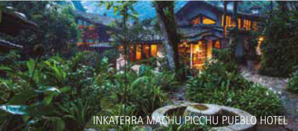
INKATERRA MACHU PICCHU PUEBLO HOTEL