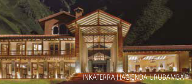
INKATERRA HACIENDA URUBAMBA