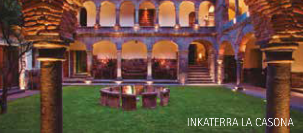
INKATERRA LA CASONA