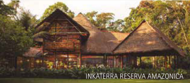
INKATERRA RESERVA AMAZONICA