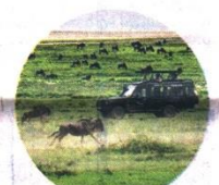
In Tanzania, new ways to survey the Serengeti.

While tourism on this South Asian island was growing in fits and starts for almost a decade, visits to the region were hampered by unrest. Lately, however, the country seems genuinely stable, and a new generation of hotels is offering luxurious and creative accommodations. The 40-room Cape Weligama opened on a 12-acre site overlooking the Indian Ocean. This spring, TRI, a new 10-suite hotel will also offer a boutique option on the banks of Lake Koggala, with a cantilevered pool and treetop yoga studio; in November, the Wild Coast Lodge will make its debut on a beautiful beach in Yala National Park, with 28 luxury tents and an Ayurvedic spa. Infrastructure is also improving. Exhibit A is a coastal highway that has made the journey between Galle and Colombo a snap. ONDINE COHANE