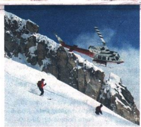
Heli-skiing will mark its 50th anniversary this year, and British Columbia is the place to be.

connect Rome and Milan; Paris and Barcelona, Spain; Istanbul and Ankara, Turkey; Beijing and Hong Kong; Seoul and Busan, South Korea; and Mecca and Medina, Saudi Arabia.