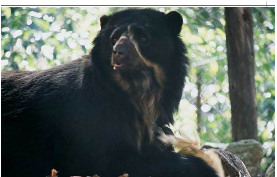
The spectacled bear's numbers have dropped to between 3,000 and 6,000