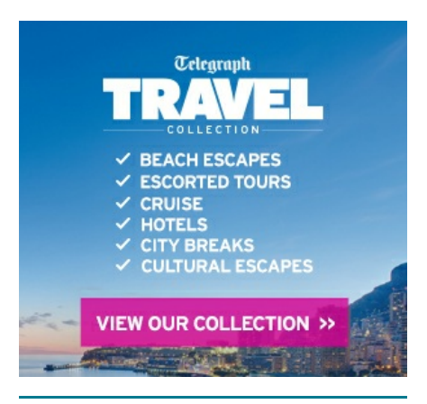
More From The Web»