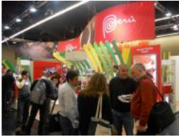
Peru: Agro-exports up by 23% between Jan.- Oct.