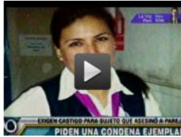
Drunk Peruvian man shoots, kills wife