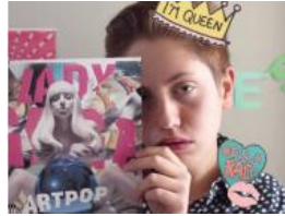
Half-Peruvian teen diva inspires and dances

Your comment will be submitted for approval by an administrator. We reserve the right to not publish offensive or profane remarks.