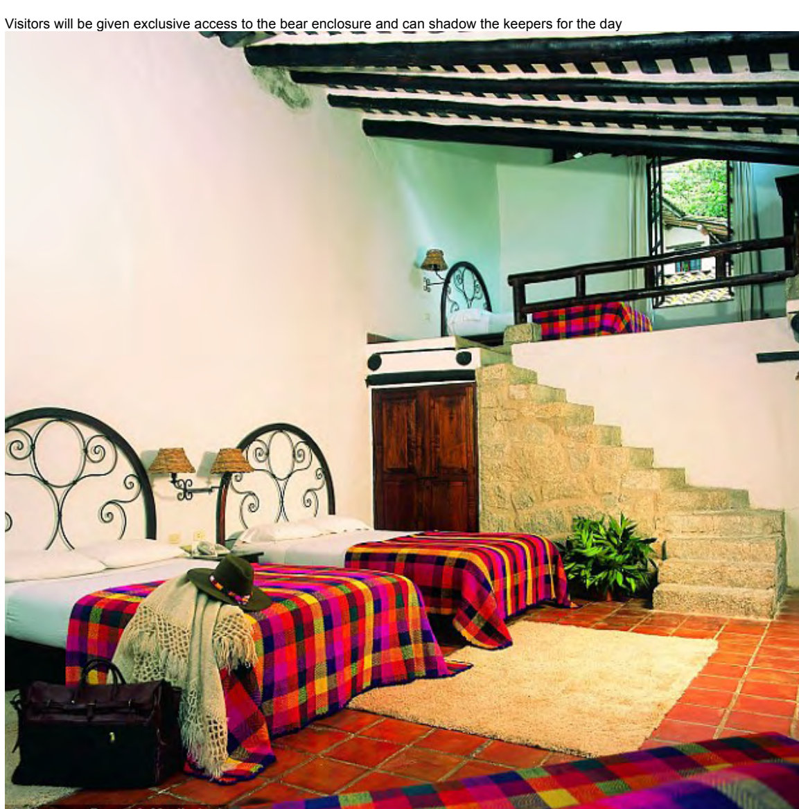
Wilderness retreat: The package includes a three-night stay at the Inkaterra Machu Picchu Hotel