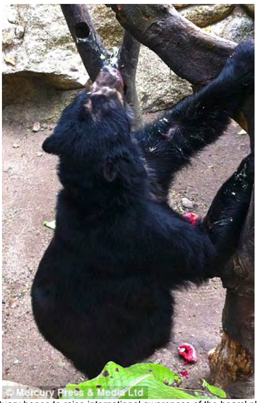
Helping them to thrive: The sanctuary hopes to raise international awareness of the bears' plight

Guests will also get a guided tour of the Machu Picchu Citadel, along with two tickets to see the upcoming Paddington Bear film, which is due to be released in October 2014.