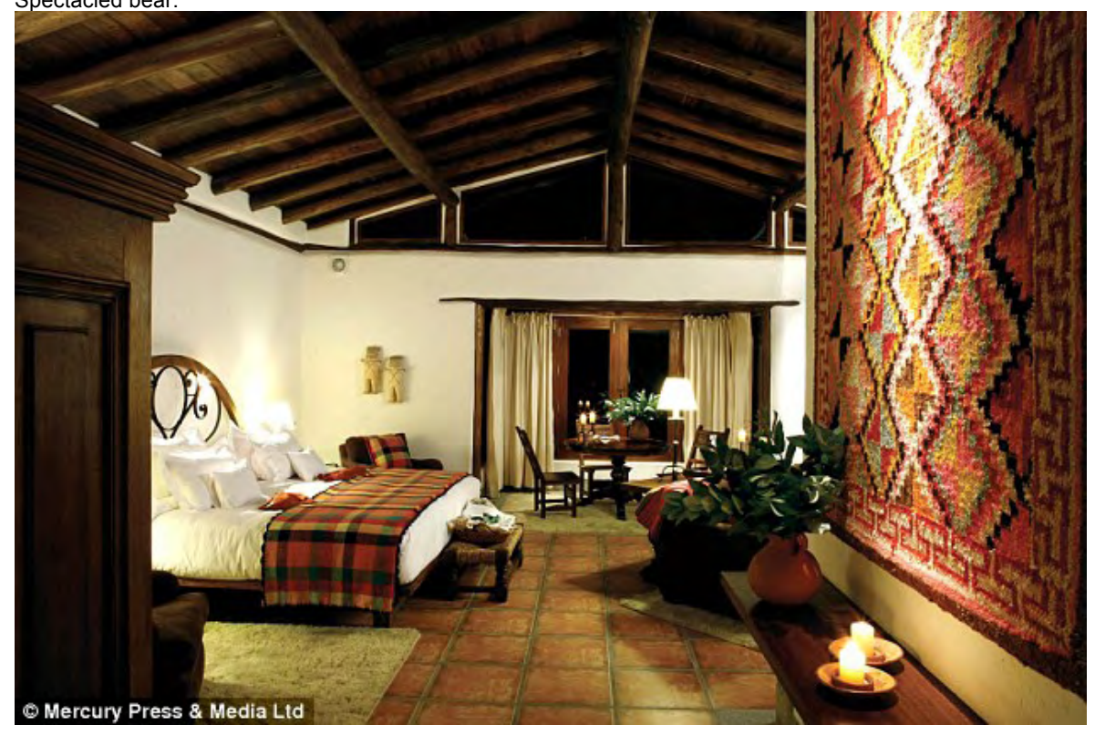
Luxury retreat: Prices for the Andean Spectacled Bear Package start from around £620 per guest

The package includes a three-night stay at the Inkaterra Machu Picchu Hotel, which is located near the sanctuary, and guests will learn about the life of a keeper at the Andean Spectacled Bear project. They will also receive a special 'bear kit', which includes a Bear Keeper's certificate and a soft toy Spectacled bear.