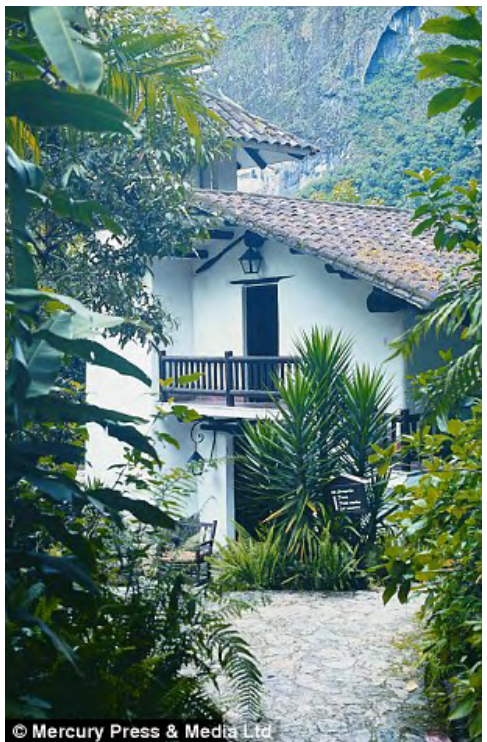
Getting back to nature: The luxury Inkaterra Machu Picchu Hotel is hidden in the mountains of Peru