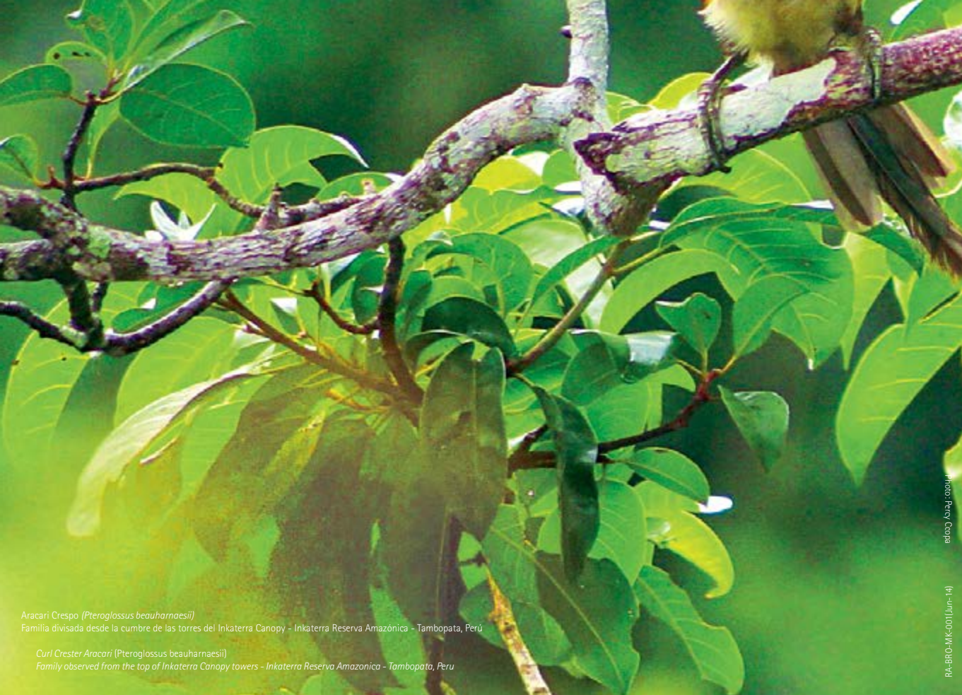
Aracari Crespo ( Pteroglossus beauharnaesii ) Familia divisada desde la cumbre de las torres del Inkaterro Canopy - Inkaterro Reserva Amazonica - Tambopata, Peru