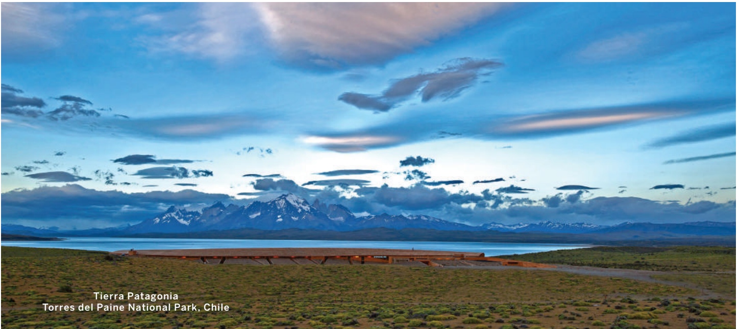
Tierra Patagonia Torres del Paine National Park, Chile