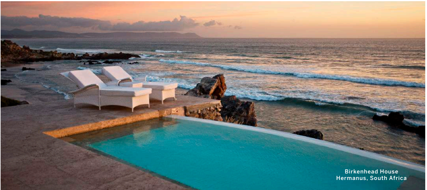
Birkenhead House Hermanus, South Africa