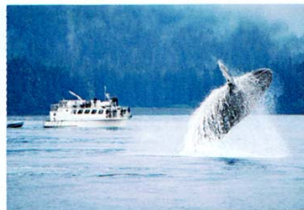
A glimpse of what you might see: This humpback is breaching, believed to be a form of communication.

Wildlife watching on the top-rated Celebrity Cruise vessel, and a private expedition via catamaran, dogsled, and seaplane