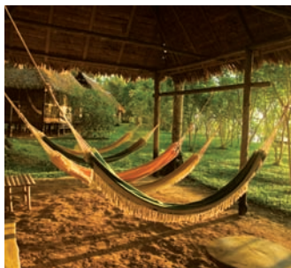
Inkaterra Reserva Amazonica