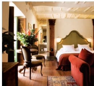
Inkaterra Machu Picchu