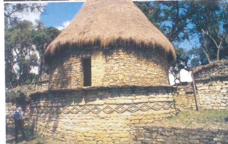
Top: Machu Picchu, Peru; Ecuadorian Amazon; Quechua child, Peru; Kuelap Fortress, Peru. Opposite: Sacha Lodge canopy walkway, Ecuador