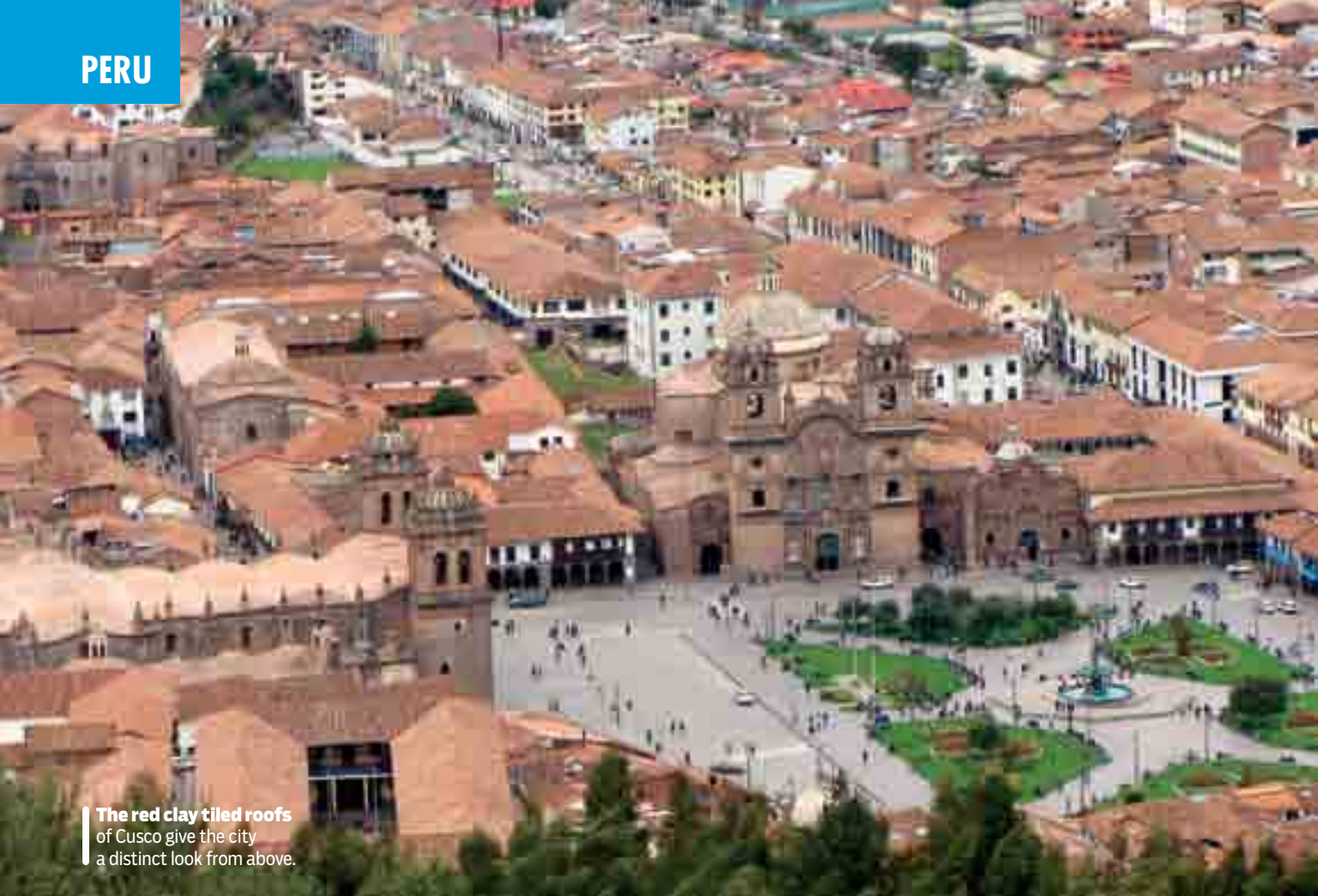
The red clay tiled roofs of Cusco give the city a distinct look from above.