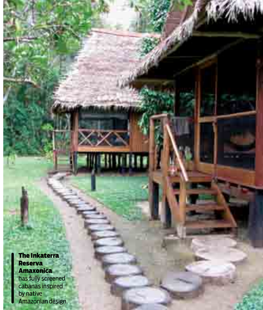
The Inkaterra Reserva Amazonica has fully screened cabanas inspired by native Amazonian design.