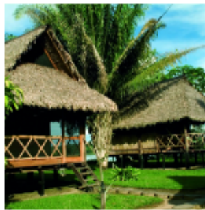
Hacienda Concepcion by Inkaterra

Hacienda Concepcion , the fifth hotel in Peru by Inkaterra opens its doors to the public. Located on the banks of the Madre de Dios River deep in the Amazon Jungle, Hacienda Concepcion is the second mid-range hotel to be offered by Inkaterra, as part of their range of more affordable accommodations, under the brand name 'by Inkaterra'.