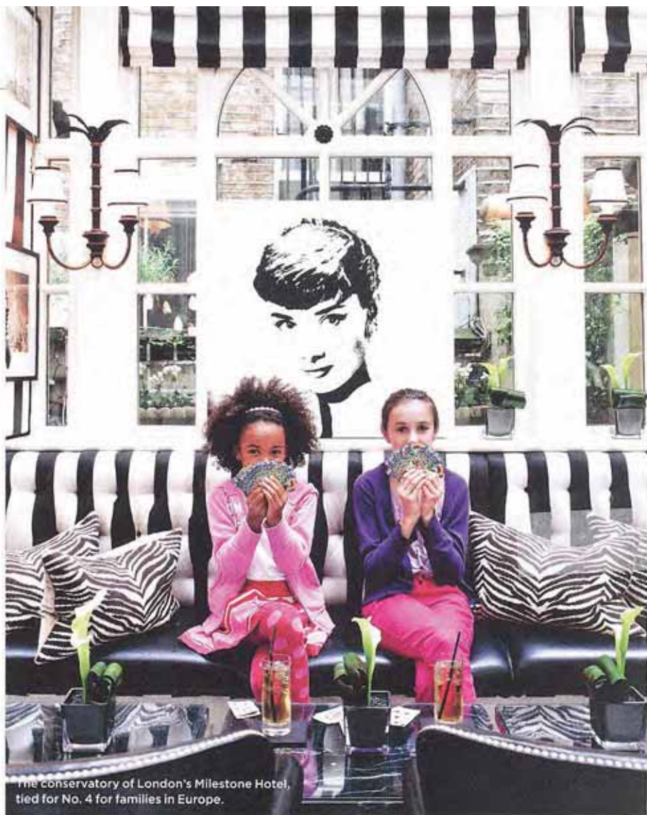
The conservatory of London's Milestone Hotel, tied for No. 4 for families in Europe.

Swim with dolphins and feed sharks at Cancún's Interactive Aquarium, a 15-minute walk away. 800/241-3333; ritzcarlton.com; doubles from $449.