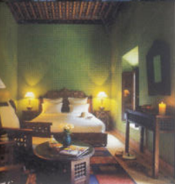
CLOCKWISE FROM TOP: HISTORIC CENTRE OF SALVADOR DA BAHIA, BRAZIL; DAR LES CIGONES, MARRAKECH, AND ONE OF ITS ROOMS