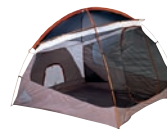
KELTY'S LIGHTWEIGHT PALISADE TENTS ARE GREAT FOR HIKE-TO SITES.

MONADNOCK STATE PARK; JAFFREY, NH Visitors to Ralph Waldo Emerson's favorite peak have a new place to stay: Gilson Pond, the park system's first new campground in 40 years. From $18 per night; reserveamerica.com .