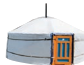
ASIAN-STYLE YURTS HAVE FUTONS, BUNK BEDS AND WRAPAROUND DECKS.

MT. MADONNA; GILROY, CA Campers in this county park can stay in Central Asian-style yurts outfitted with locking doors. Outside each yurt is a fire pit for cooking dinner under the redwoods. From $35 per night; gooutsideandplay.org .