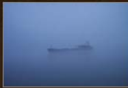
Bowermaster's Adventures: Transiting the Atlantic Ocean by ship