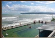
Weekending: Varna, Bulgaria