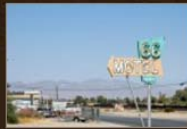
Gadling's favorite hotels for 2011