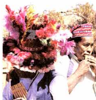
ON TOP OF THE WORLD (Above) Taquile islanders; (main) the breathtaking vista from Machu Picchu

From the mountains to the heart of the city, we headed back to Cusco. The highlight was the Cathedral, which houses the city's collection of colonial art, although our guide explained that the Andean people managed to surreptitiously represent their own gods in the churches of their