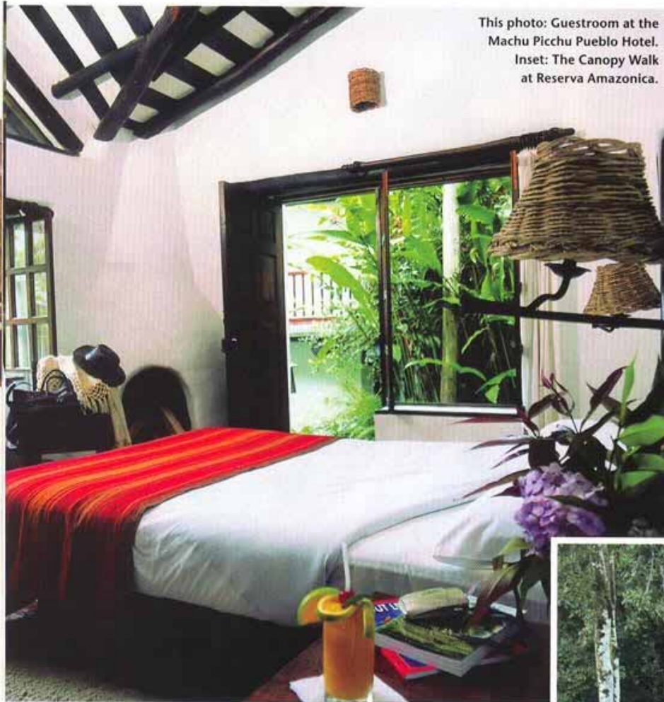
This photo: Guestroom at the Machu Picchu Pueblo Hotel. Inset: The Canopy Walk at Reserva Amazonica.

Association promotes education and conservation.